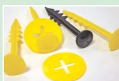
Plastic fixing pegs and parking bay markers / washers