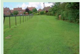
After installation - grass grows through quickly