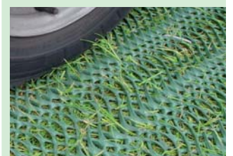
Mesh after installation