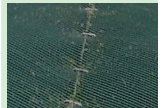
Mesh 'Butt' joined using U-pins