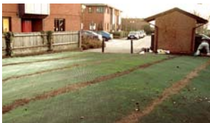
Mesh upon installation

GrassProtecta® is simply installed onto the existing grass surface. The grass will quickly grow through the mesh apertures and the area will return to a natural grassed appearance. This may take a longer period of time out of the growing season.