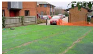
After 1 week the grass starts to grow through the mesh