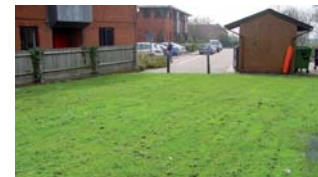
After just a few weeks the grass has fully grown through