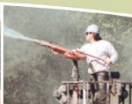
Hydroseeders with jet-actuated machines increase productivity and produce superior results with ProPlus Hydro Mulching Solutions.