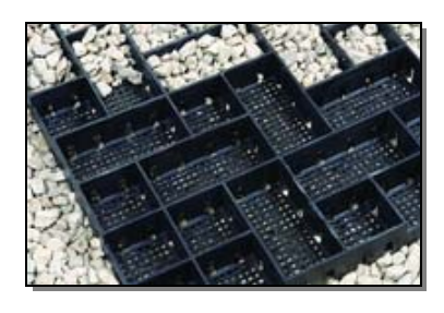
Figure 2 GeoPave Cell Configuration