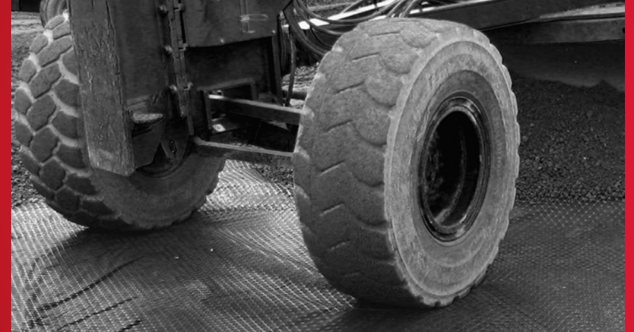
Geogrid can be trafficked directly by rubber-tired equipment.