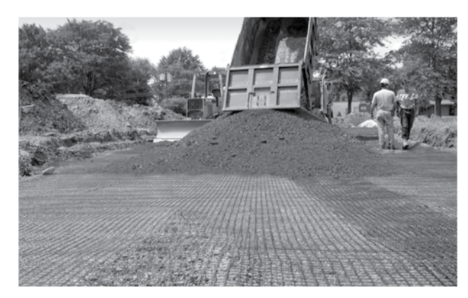
IMAGE 9A: End dumping aggregate fill on top of Tensar Geogrid over soft subgrade.