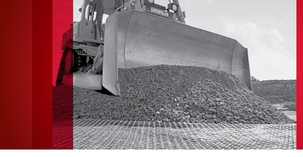
IMAGE 8: Dumping aggregate fill on top of Tensar® Geogrid over competent subgrade.