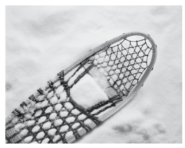
IMAGE 1: The Snowshoe Effect - Tensar TriAx Geogrids distribute heavy loads over soft soils just like a snowshoe supports the weight of a man over soft snow.

*This guide cannot account for every possible construction scenario, but it does cover most applications. If you have questions regarding a specific project, call 800-TENSAR-1 or visit www.TensarCorp.com.