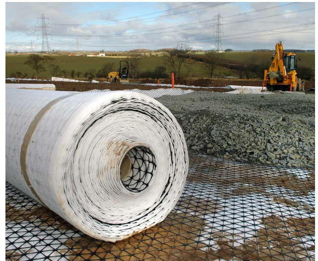
The high profile ribs and nodes of TriAx geogrid allow full aggregate strikethrough when combined with a nonwoven geotextile.

FilterGrid stabilizes working surfaces, such as paved and unpaved roadways, airfields, crane pads and other working surfaces by providing confinement, separation and filtration. FilterGrid combines the stabilization benefits of TriAx with the separation and filtration benefits of a non-woven fabric.