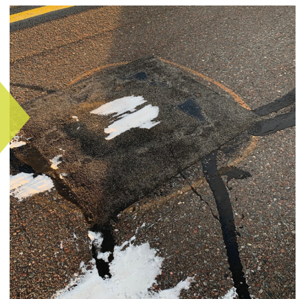
(Fig.1) Patch after 2 feet of snow and plowing