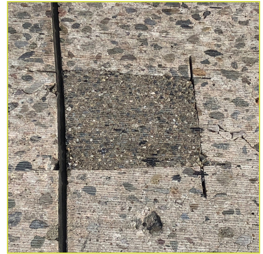
Saw cut in concrete on highway. Edges continue to degrade.

Using American Road Patch™ on saw cut repairs saves time and money. Simply cut American Road Patch to size, ensuring the patch extends beyond the cuts by a minimum of 4" (10 cm) on all sides. Install the patch according to the instructions. American Road Patch™ will bond with the surface, sealing the repair from water and debris, while also securing the fill material. Using American Road Patch™ ensures a long term, water tight repair.