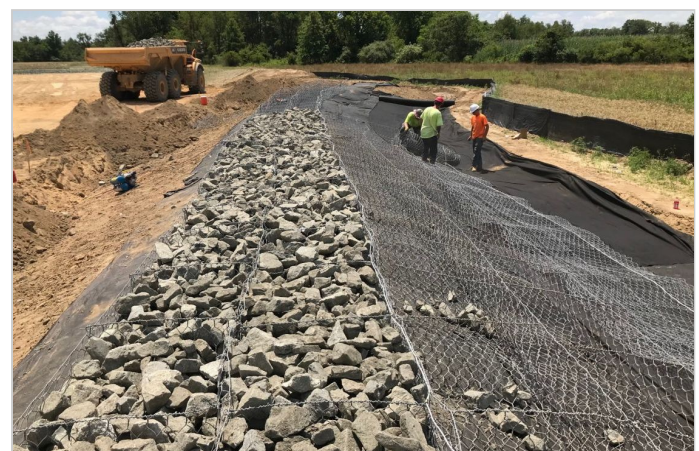
Gabion Mats being rolled out and filled