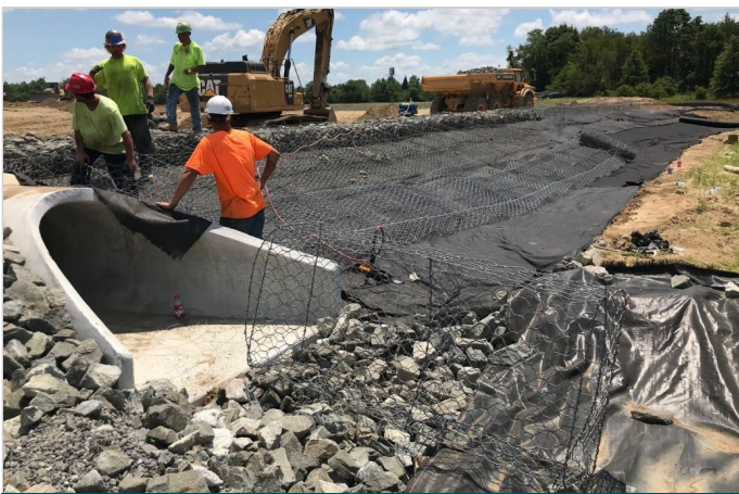
Gabion Mat being cut to fit next to concrete outlet structure