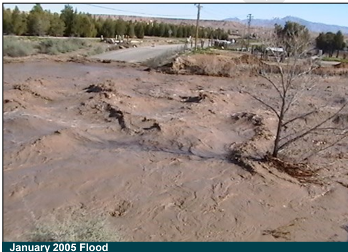
January 2005 Flood