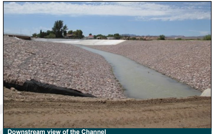
Downstream view of the Channel

GC Wallace Inc. (GCW), a civil engineering firm in Las Vegas, NV, designed the Muddy River—Cooper Street Bridge rehabilitation project that consisted of widening of the Muddy River as a flood control measure to keep the storm flows contained within the channel, adjacent properties and structures were affected when the river swelled up during storm events. This project was the first phase of a much longer plan for river widening to mitigate the flooding along the Muddy River. The Cooper Street Muddy River crossing was a low water crossing