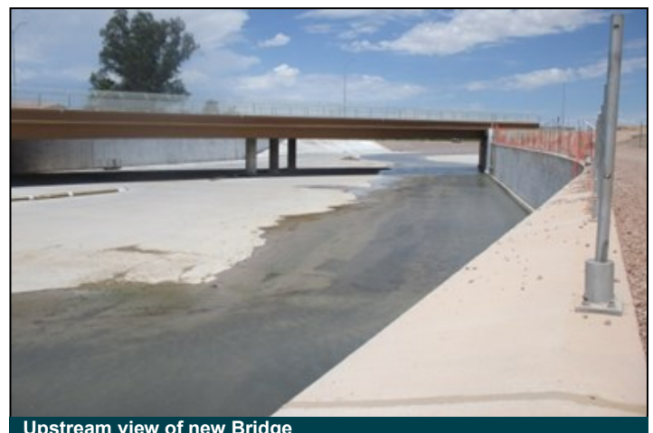
Upstream view of new Bridge