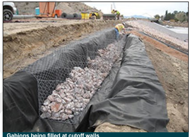
Gabions being filled at cutoff walls