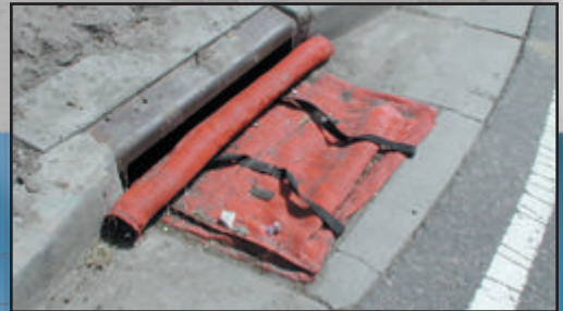
DANDY CURB BAG®

Dandy's inlet protection products were installed throughout the project and were used and re-used because they were properly maintained - this saved Denver both time and money. Performance studies have been done on Dandy Products by the Colorado DOT and the positive results have lead them to use more and more Dandy Products on construction projects throughout the state.