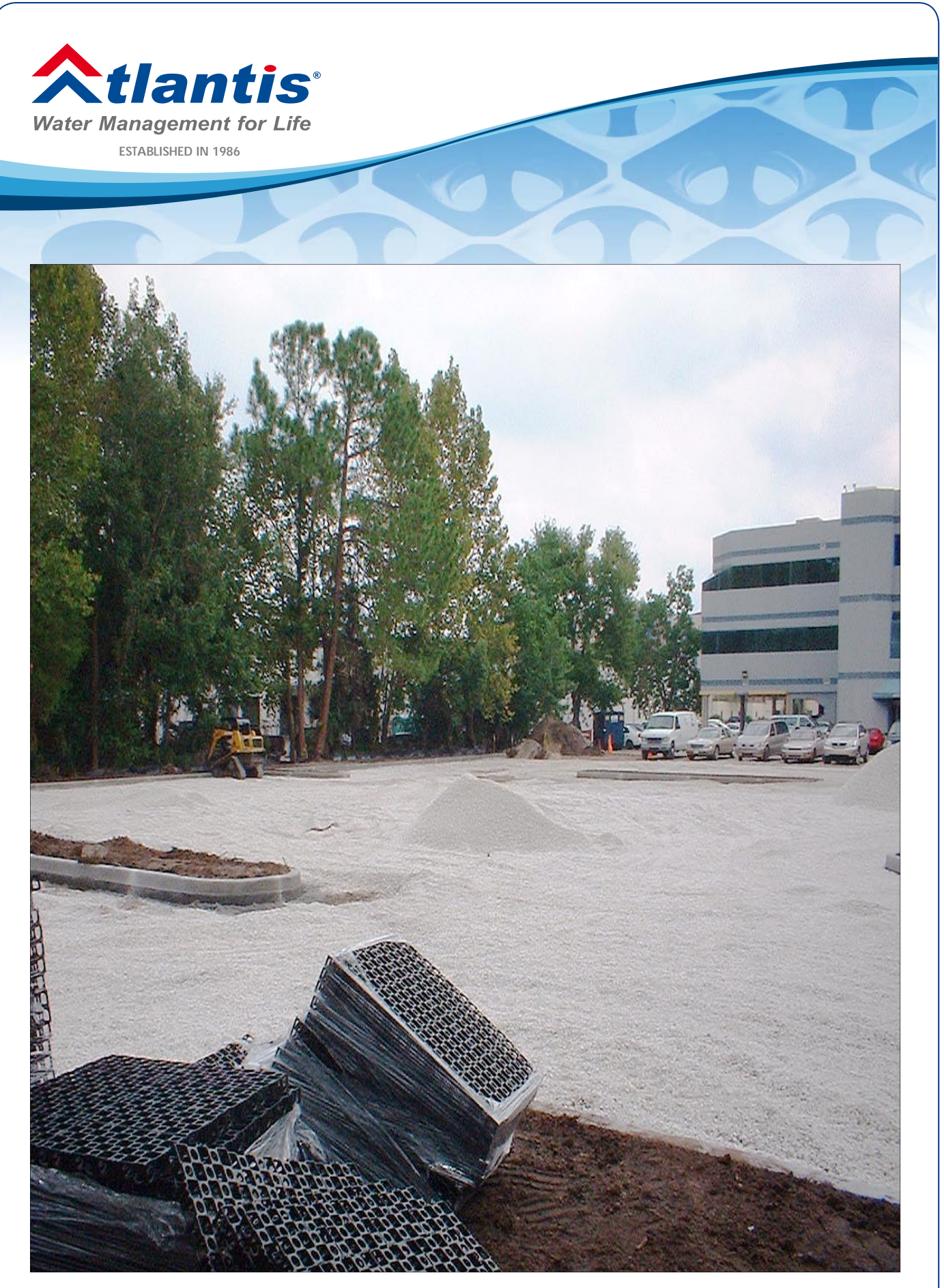
Preparing the sandy base of the Atlantis® Turf Cell® installation.