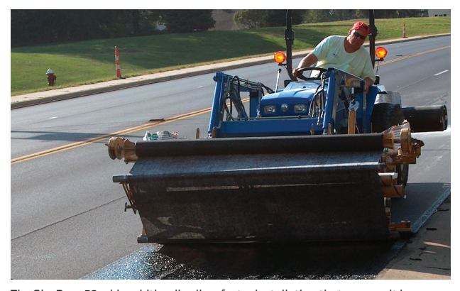
The GlasPave 50 wide-width rolls allow faster installation that can result in a savings on labor costs.

THE CHALLENGE: Due to reflective cracking, concrete streets with asphalt overlays tend to have a short service life, 10 years or less, and expensive pavement maintenance afterwards. The challenge was to increase the life cycle of resurfaced streets and decrease the maintenance costs by reducing the number of joint repairs, reinforcing the resurfaced asphalt and waterproofing the pavement. The City of Westlake's 20-foot wide concrete streets featured centerline and transverse joints every 25 feet that were randomly failing.