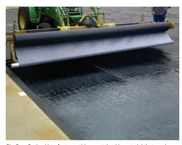
GlasPave Paving Mats feature a thinner yet durable material that requires less tack coat during the installation process than other paving mats. Often times, the amount of required tack coat can be reduced by half!

THE GLASPAVE ADVANTAGE: The fiberglass matrix in a GlasPave paving mat provides significantly greater tensile strength at low strain when compared to conventional paving fabrics and other paving mats. This helps extend pavement life, even in the harshest environments, by delaying reflective cracking, which is a common contributor to costly repairs and the eventual failure of asphalt overlay applications. Also, the non-woven matrix structure of GlasPave allows for an asphalt binder to penetrate and fill voids within the fabric to limit moisture infiltration into the pavement. The distinctive design facilitates a quick and strong bond with a variety of tack coats.