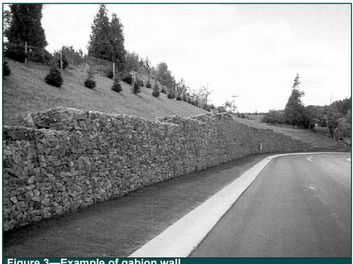
Figure 3—Example of gabion wall