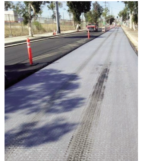
Mirafi® PGM-G 4 installed on right lane prior to overlay. Left lane completed.

TenCate Geosynthetics Americas assumes no liability for the accuracy or completeness of this information or for the ultimate use by the purchaser. TenCate Geosynthetics Americas disclaims any and all express, implied, or statutory standards, warranties or guarantees, including without limitation any implied warranty as to merchantability or fitness for a particular purpose or arising from a course of dealing or usage of trade as to any equipment, materials, or information furnished herewith. This document should not be construed as engineering advice.