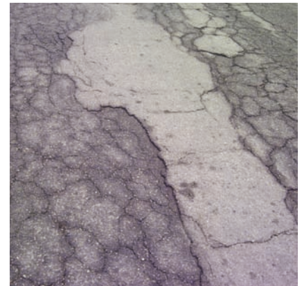
Port of LA terminal before construction.