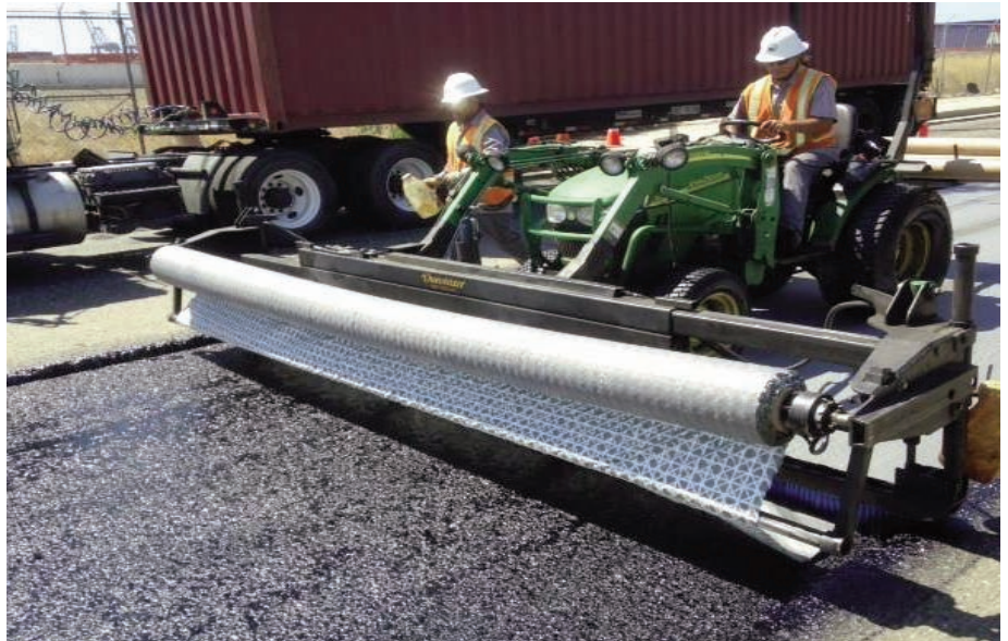
Installation of Mirafi® PGM-G 4 composite paving grid.

5. Wide width efficient installation: Mirafi® PGM-G 4 is available in 12.5' widths, reducing longitudinal laps by over 50%, is strong, but flexible, adding to the ease and speed of installation.