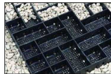
Figure 2 GeoPave Cell Configuration