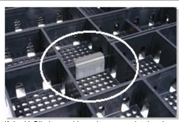
If the U-Clip is not driven down completely, place the driver head over the U-Clip and repeat Step 3.