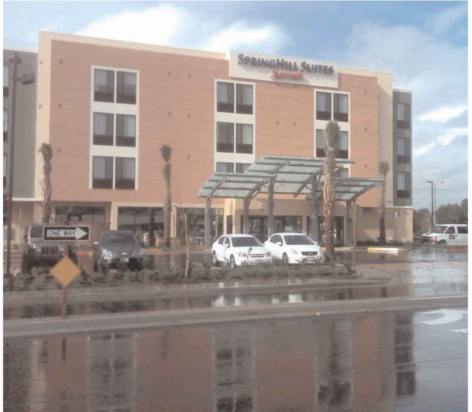
Mirafi® BXG Series geogrids, manufactured from polyester yarns, are ideal for supporting long-term static building loads.

A 4-story hotel was constructed on soft subgrade using the economy of geosynthetics made of polyester fibers. The design did not require costly piles or stone columns to support the building. The design used the native soil blended with sandy gravel and the friction provided by Mirafi® BXG biaxial geogrids to provide soil stabilization, limit differential settlement and resist seismic liquefaction.