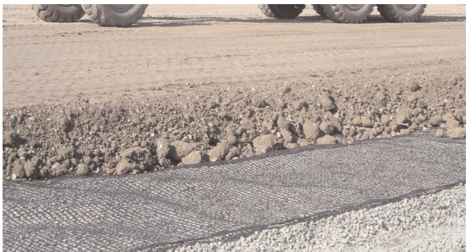
Five layers of Mirafi® BXG geogrid were installed to create a stabilized geogrid reinforced platform.