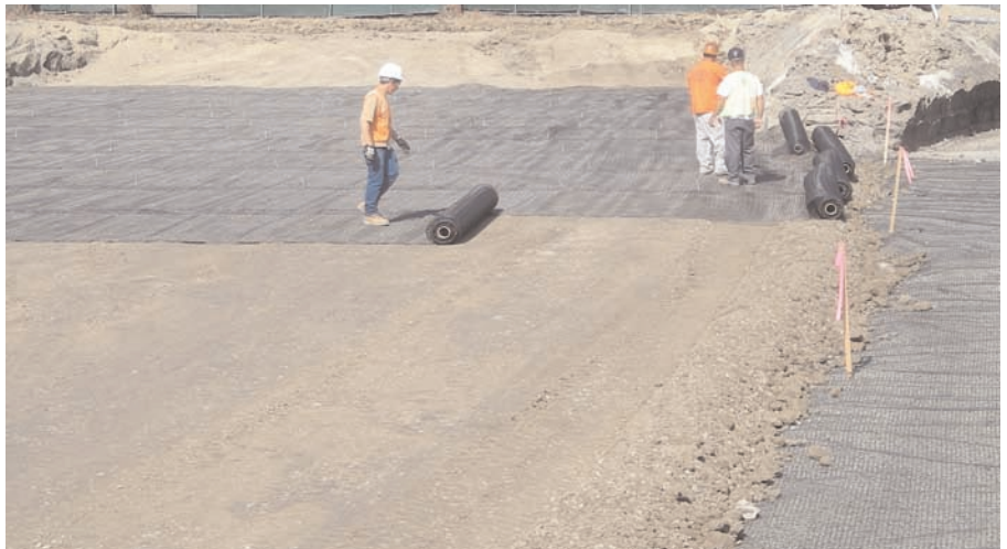
Mirafi® BXG geogrid is cost effective, lightweight and easy to install.

the subgrade for construction, as done in the case study for the Geothermal Plant constructed in Brawley, California. The bottom geogrid lift was constructed using Mirafi® BXG12 biaxial geogrid. The first 8-inch compacted lift of the blended soil mix was placed using scrapers and dozers to spread the material.