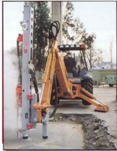
Top Hammer Rock Drill

Top Hammer or down-the-hole hammer rock drills are very effective for installation of Manta Ray and Stingray anchors. For hard soil or weak rock installations, the drill can be used to drill a pilot hole. Foresight can provide striker bar adapters for these types of drills. Rock drilling steel can also be modified to drive Manta Rays and Stingrays.