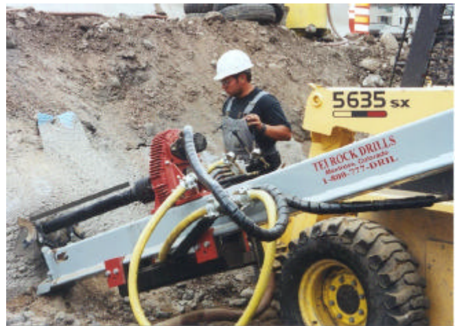
Down Hole Hammer