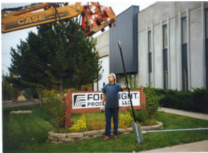
Vibro on Backhoe