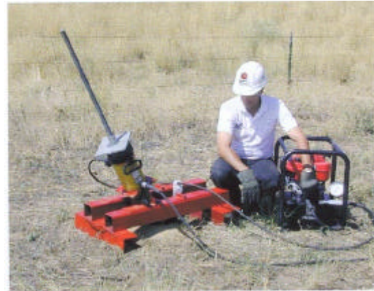
SR-LLK for Stingray

For Stingray, the SR-LLK is a 60-ton double acting jack with a 10-inch stroke, which includes a hydraulic power supply. It is available in two models, one for tower guy anchors and one for retaining wall tieback anchors.