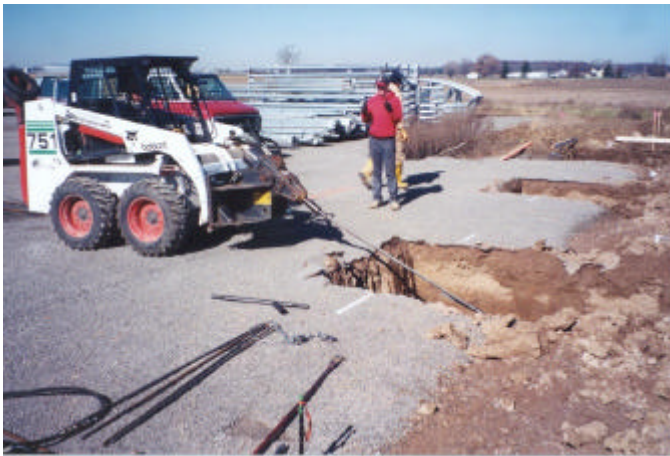
Concrete Breaker on Skid Steer

Boom mounted demolitions or compactions are very effective for driving Manta Ray and Stingray anchors. This method requires a special tool in the breaker or a socket welded to the bottom of the compactor to hold the drive steel. Skid Steer Loaders, Loader-Backhoes or Excavators work well. 4,000 to 16,000 lb. Vehicles with 250 to 500 foot-pound pavement breakers are best for Manta Rays, and 16,000 to 30,000 lb. Vehicles with 500 to 1,000 foot-pound pavement breakers are best for Stingrays. Breaker tools and vibro sockets are available from Foresight Products.