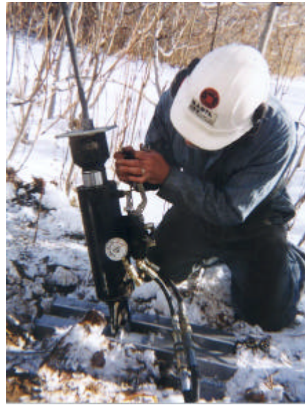
LL-1 for Manta Ray

For Manta Ray, the LL-1 is a 10-ton fast acting jack with an 8-inch stroke. The direct reading gauge and rod gripping jaws make load locking easy and quick. For high capacity Stingrays, the LL-40 is a 20-ton jack with a 10-inch stroke. The base and jack are self-aligning to the actual installed angle of the anchor. Both kits require open center hydraulic flow of 2 to 8 gallons per minute and a maximum pressure of 2,000 psi. A power supply is not included with these load-locking kits, it must be provided separately. Foresight Products models GPU18-8 or GPU-2 are suitable for the LL-1. GPU18-8 is required for the LL-40.