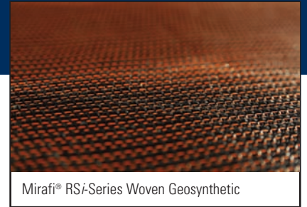
Mirafi® RSi-Series Woven Geosynthetic

Geosynthetic Placement Place the geosynthetic directly on prepared surface. It is advisable to leave vegetative cover such as grass and weeds in place to provide a support matting for construction activities. The geosynthetic should be deployed flat and tight with no wrinkles or folds. The rolls should be oriented as shown on plans to insure the principal strength direction of the material is placed in the correct orientation. Adjacent rolls should be overlapped or seamed as a function of subgrade strength (CBR). Prior to fill placement, Mirafi® RSi-Series geosynthetics should be held in place using suitable means such as pins, soil, staples and sandbags to limit movement during fill placement.